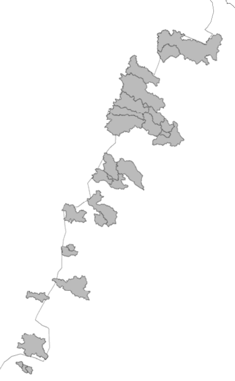
Figure 2. Areas of interest are situated close to the Swedish-Norwegian border in the northern Scandinavia. The major areas are 15, however some areas are divided in sub basins for the HBV-model.