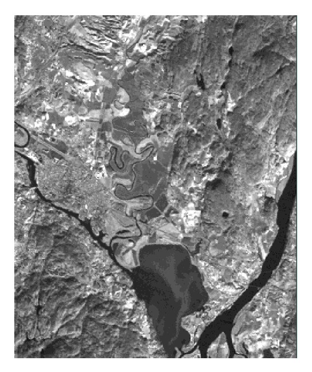
Figure 1. Landsat TM image band 4 (near infrared) acquired on October 20, 1991 over Kjeller, one of the soil erosion monitoring test sites.

The optical experiments showed that the weather conditions in Norway in the late autumn make it difficult to obtain cloud-free images, and are thus a limiting factor. Therefore, an experiment was carried out during the autumn 1991 using ERS-1 Synthetic Aperture Radar (SAR) images (Solberg 1992, Weydahl 1992). The SAR is able to observe the Earth's surface regardless of the atmospheric conditions, cloud cover and daylight. The ERS-1 SAR instrument has only one band (one frequency at 5.3 GHz and VV-polarization). In general, multiband data (multi frequency and multi polarization) give the best results, but the available data from operational SAR