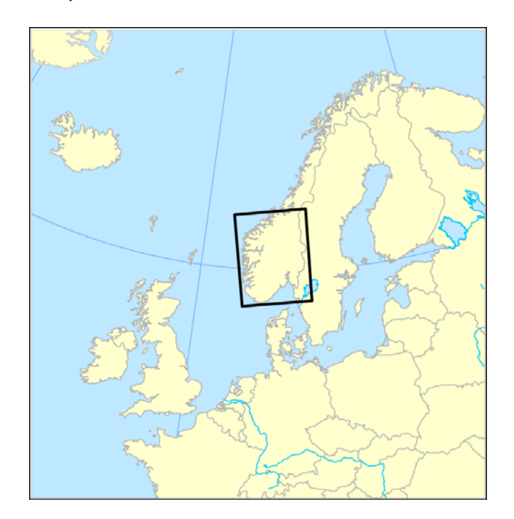
Figure 1. The study area, southern Norway.