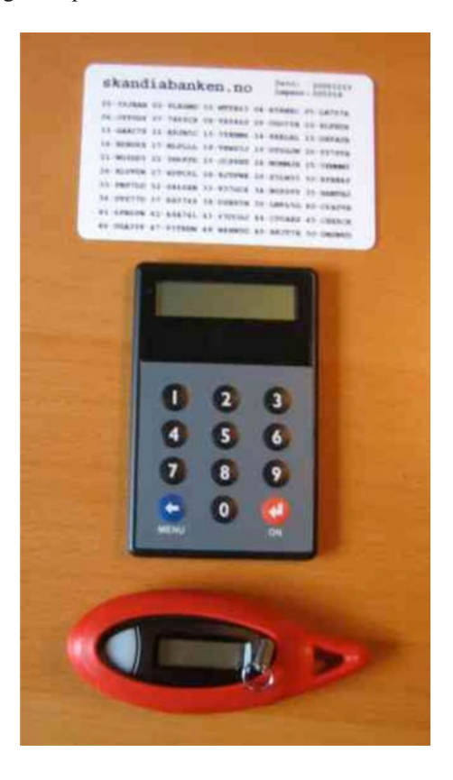
Fig. 3 Diverse authentication tokens used for internet banking

In order to increase security, many Internet banks are replacing code cards with a hardware token that generates a onetime authentication code. Again, the text size represents a challenge to many users. Another challenge is the display time which may be too short, especially if the user needs to use a magnifying glass in order to read the code, or if the user is dyslectic and needs longer time to be sure about the sequence. However, there is a potential in making code calculators more accessible. For example the bank DnB NOR in Norway offer their visually impaired customers a hardware token with large display, clear contrasts and text to speech functionality which can read the code out loud through ear phones.