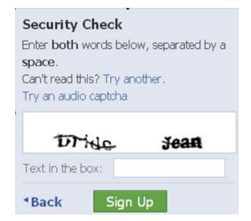
Fig. 5 Facebook offers both text based and audio based CAPTCHAs. (www.facebook.com)

However, biometric authentication might have large disadvantages in field use. Fingerprint scanning is clearly not suitable for paralyzed users who cannot defend themselves against having their finger scanned by a malicious intruder in their